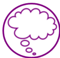
Daring to Dream