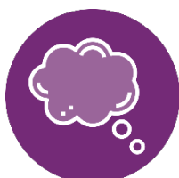
Daring to Dream